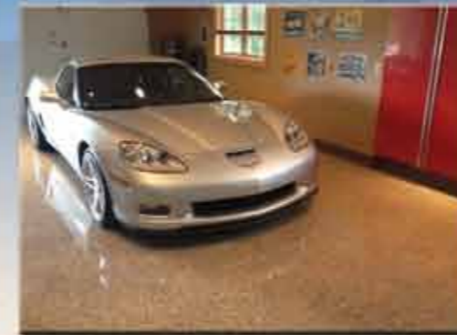
GARAGE FLOOR APPLICATIONS

GARAGE FLOORS • POOL DECKS • PATIOS • DRIVEWAYS SHOWROOMS • KITCHEN FLOORS • OFFICES INDUSTRIAL APPLICATIONS • COMMERCIAL APPLICATIONS