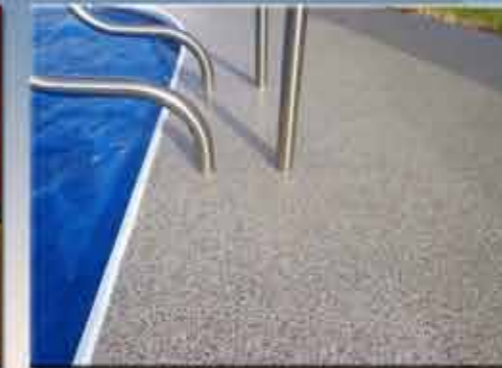
POOL DECK APPLICATIONS